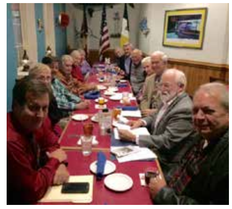
The membership of the Outer Banks Chapter of the NC Society of the SAR gathers at its monthly dinner and program meeting in Kill Devil Hills, NC. The chapter draws its membership from eligible compatriots of Dare and Currituck Counties, and continues to grow in size since its charter date of only a few years ago.